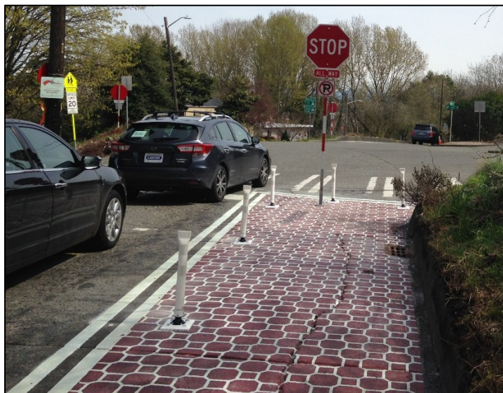
Figure 3: Example of decorative painted bulb