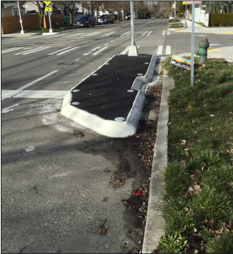
Figure 4: Example of Asphalt Island Bulb